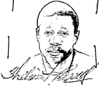
RUSSELL, WILLIAM FELTON 5/29/68