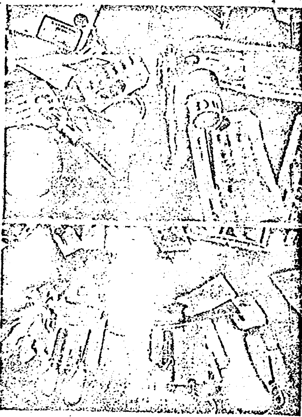
Confiscated burglary tools used by men caught breaking into Democratic National Headquarters in Watergate Complex last year, according to NBC News. Items included (top) flashlight, screwdrivers, camera, (bottom) lock picks, and false identification.