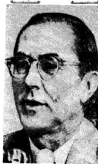
William E. Colby

Domestic use of CIA authority is clearly illegal. Although the agency wavered under the strong