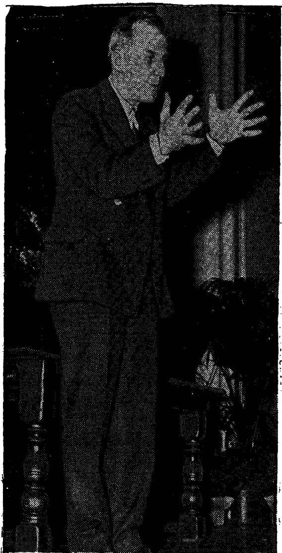
CRIME FOE —Gen. Smedley Butler, dynamic former Marine corps commander, addresses 1,000 women in Cherry Valley School of Garden City, N. Y., on crime. The general, in his usual two-fisted manner, laid a verbal barrage on crooked politicians, the Hauptmann trial and gangster films, as well as many other subjects, and said people generally have forgotten God and the Bible.