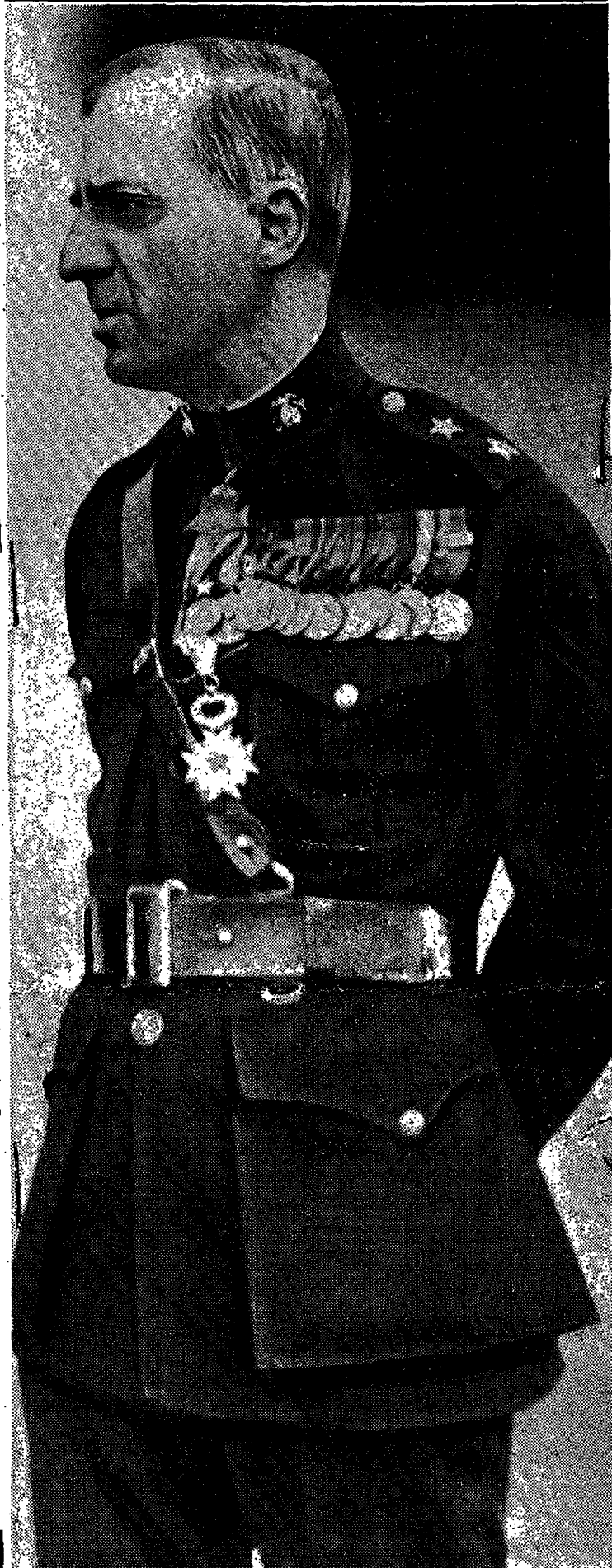
Major General Smedley D. Butler, shown here in the full dress of the U. S. Marines he formerly bossed, will tell a Congressional committee that a Wall Street clique wanted him to lead a Fascist army of 500,000 to take over the power of the Government.