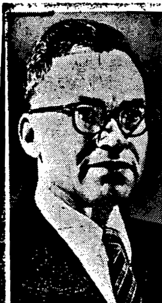
FREEDOM SOUGHT: Morton Sobell, who was convicted in atom spying case.