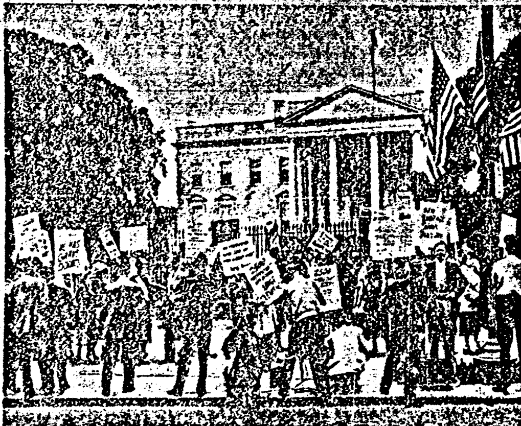
"VIGIL OF MERCY" —Some of 7,000 persons who picketed White House yesterday are shown parading as they began 24-hour "vigil for mercy" in hope of getting clemency for spies Julius and Ethel Rosenberg, scheduled to die Thursday.