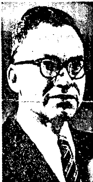
FREEDOM SOUGHT: Morton Sobell, who was convicted in atom-spying case.