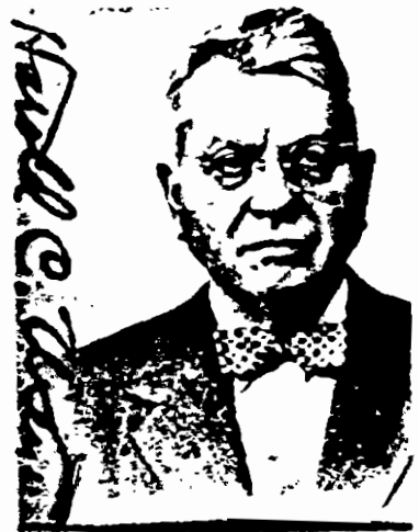
HAROLD CLAYTON UREY April 1954