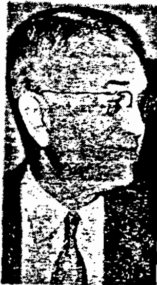
Harold C. Urey at Standard Club.

Once life began—life in tiny, reproducing cells, that is—the chain of evolution was rather simple, Urey said. He noted cells in plants, animals and man react almost similarly to various chemicals. Man, he said, is but one simple step in the chain.