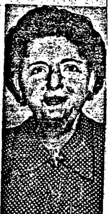
ELIZABETH BENTLEY

"We have made no private investigation of Miss Bentley," he said. "We have only studied her writings and the public record. All of her statements that are susceptible to check have been checked against the known facts and we have found her statements could not have been correct."