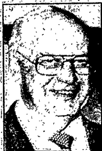
BOTHA: Secret meeting

Coetsee said no policy matters were debated and no negotiations were conducted, but that the two men "availed themselves of the opportunity to confirm their support for peaceful development in South Africa."