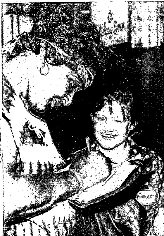
Winnie Mandela autographed a notebook yesterday after visiting her husband, Nelson, outside Cape Town, where he remains under confinement on a prison farm. Mr. Mandela, the long-jailed leader of the African National Congress, asked her to begin arrangements for his release, signaling that he expects to be free within weeks.

1940 PAARL, South Africa, Jan. 8 (Reuters) — Nelson R. Mandela, the long-imprisoned anti-apartheid leader, indicated today for the first time that he expected to be freed within weeks, his wife said.