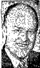
Melvin R. Laird

"nonpolitical," is scheduled for 10:05 a.m. in Uihlein Hall.