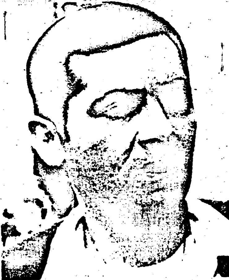
Rabbi Meir Kahane