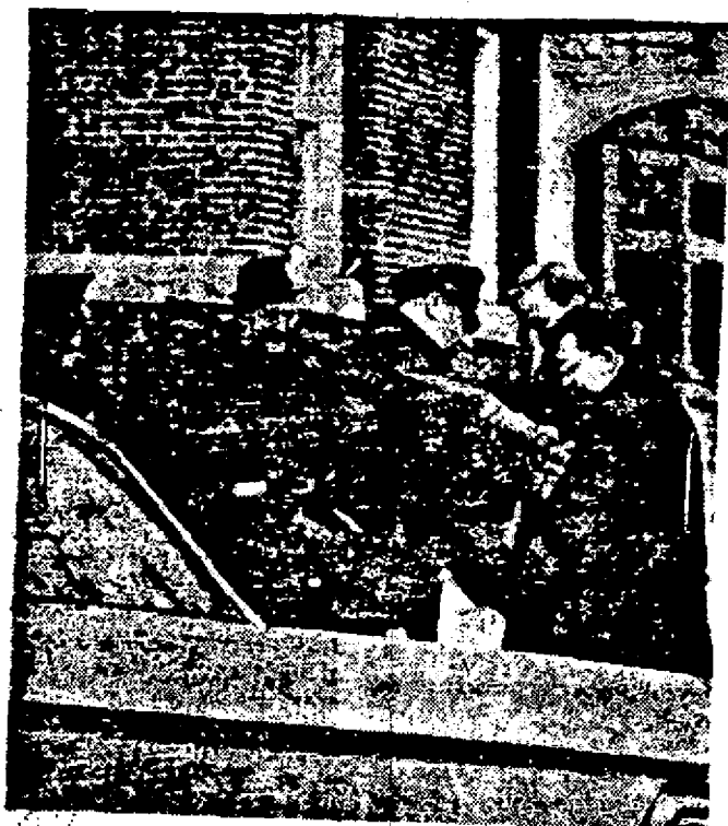
Police guards outside the residence of Black Muslim leader Elijah Muhammad, 4847 Woodlawn, interrogate and search visitors at driveway entrance to the mansion.