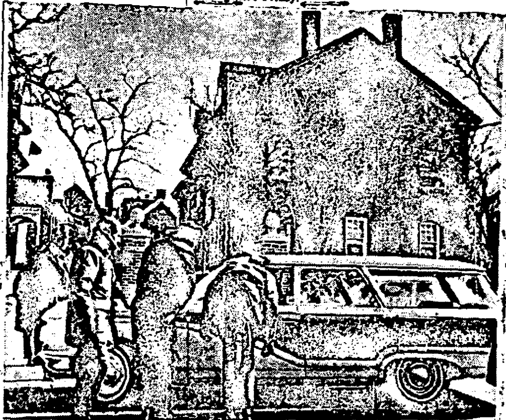
GUARD BLACK MUSLIM LEADER: Policemen in Chicago inspecting automobile yesterday at home of Elijah Muhammad, the leader of Black Muslim sect. In 1964 Elijah Muhammad broke with Malcolm X, who was slain on Sunday. Breach was never repaired.

About 6,000 Black Muslims are expected at the convention starting here Friday.