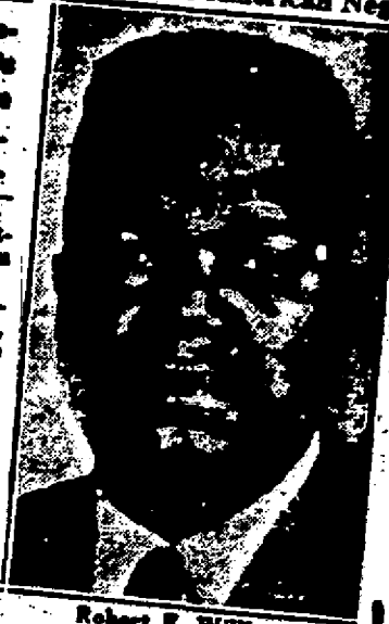
Robert F. Williams Dedicated to violence

The investigation "should not rule out that this may be the beginning of a series of acts undertaken by Peking-orientated Com-