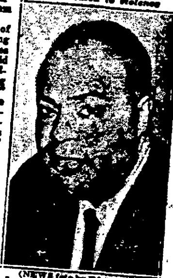
James Farmer at press conference at CORE headquarters