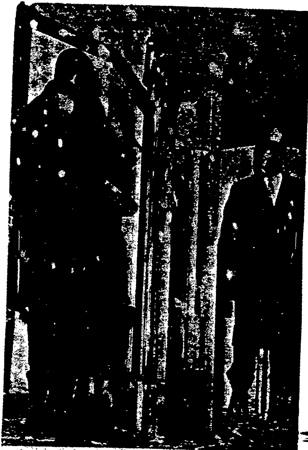
Black Muslim guards preparing to move grandfather clock into home of Elijah Muhammad, sect leader, at 4867 Woodlawn av. Police examined clock and wooden crate before permitting Muslims to take it into home.