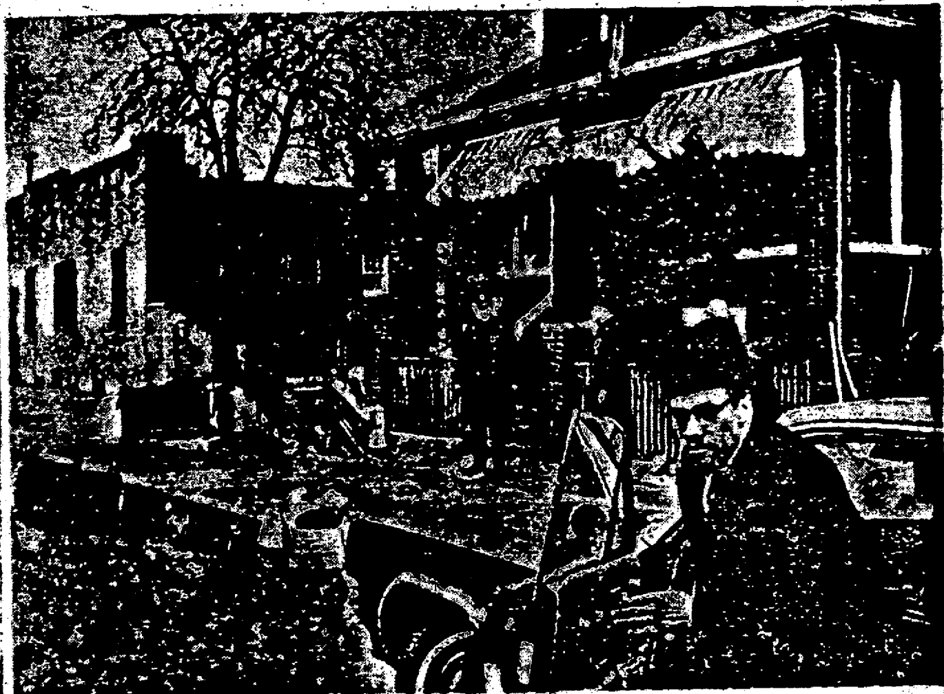
MELANCHOLY MALCOLM — Negro leader Malcolm X sits in front of his home which was heavily damaged by fire bomb. Spread furniture and possessions litter street. Malcolm, wife, and four children escaped injury yesterday.