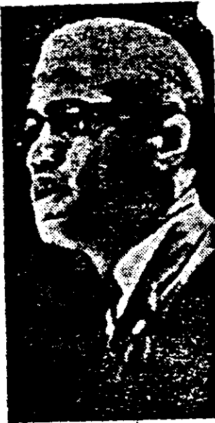
The New York Times CRITICAL OF KENNEDY: Malcolm X, a leader of the Black Muslims, during a speech at Manhattan Center.

Later a member of the audience who declined to be identified told a reporter his enjoyment of this remark was "more for the fact that he had the