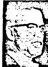
Malcolm X ... hypnotic manner

"There were guards at the entrance, guards at the bottom of the stairs, guards up in the hall. The men were searched at the bottom of the stairs by the guards. They took everything metallic like