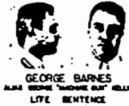
GEORGE BARNES ALIAS GEORGE "MACHINE GUN" KELLY LIFE SENTENCE