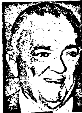
J. Edgar Hoover

Hoover was roundly criticized recently for reportedly old man out of step with the calling integrationist leader King "a liar." They have met since, and the outcome was "amicable," if not enthusiastic.