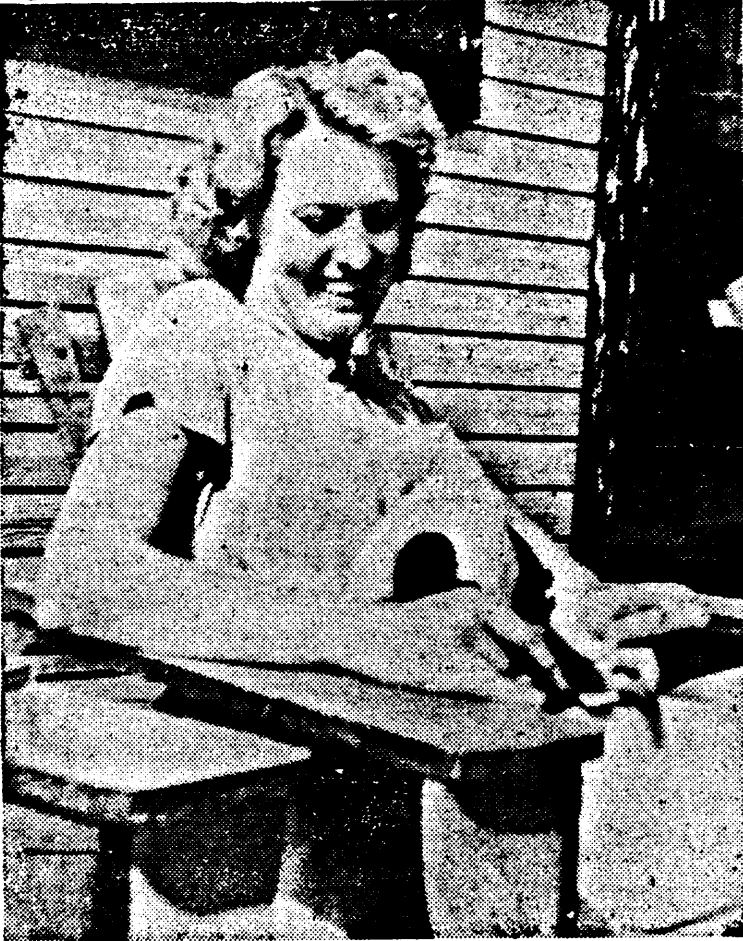
Mrs. Eva Braun