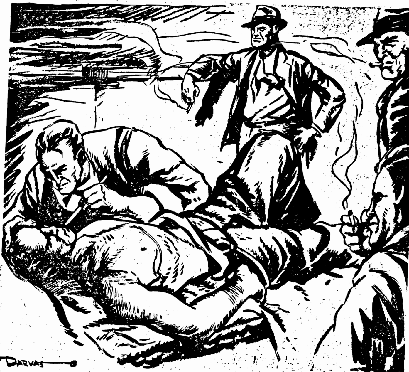
In a Collingwood Avenue apartment he altered their fingers and faces—