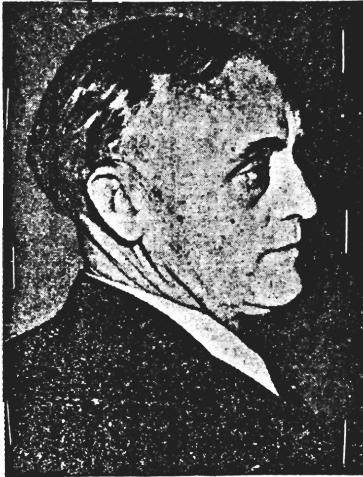
CIRCUIT JUDGE EARL WITT