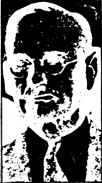
WILLIAM MEAD Seized by G-Men