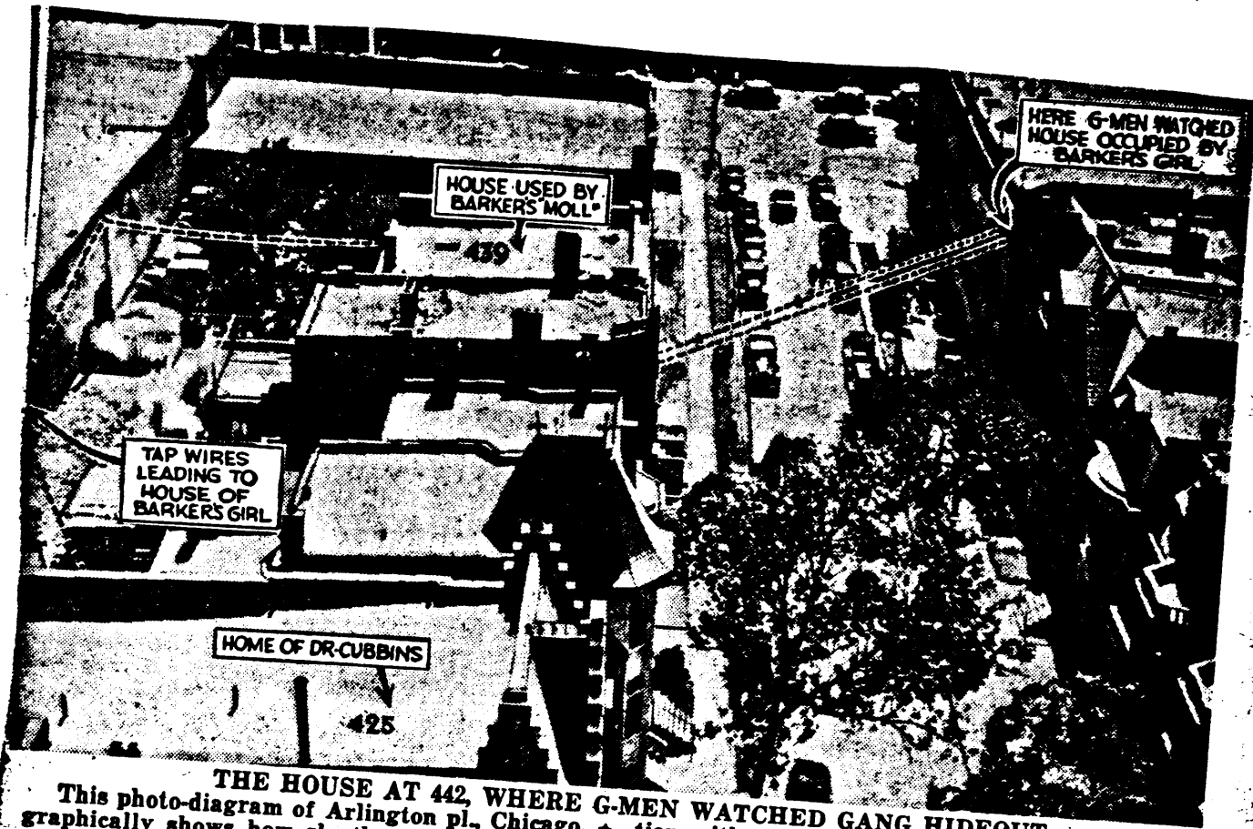
THE HOUSE AT 442, WHERE G-MEN WATCHED GANG HIDEOUT This photo-diagram of Arlington pl., Chicago, graphically shows how sleuths gained information without the killer's girl friend suspecting. Barker's moll was staying at 439.