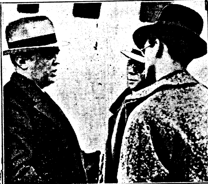
J. EDGAR HOOVER (LEFT) AND REPORTERS.

G-man is shown being interviewed in Chicago.