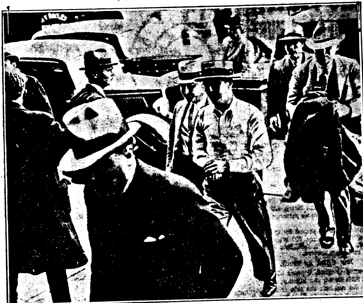
Alvin Karpis (coatless) being conducted into federal building at St. Paul yesterday after plane flight from New Orleans, where he was captured by department of justice agents. J. Edgar Hoover, chief of the G-men, who led the raid that resulted in Karpis' capture, is in the left foreground.