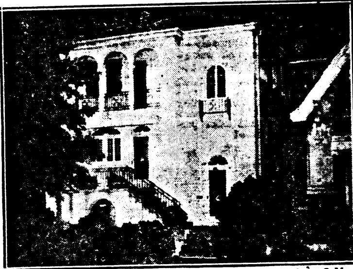
The apartment house on Canal Street in New Orleans, where G-Men, under J. Edgar Hoover, apprehended Alvin Karpis. Karpis was living here with a young girl under the name of Mr. and Mrs. O'Hara.