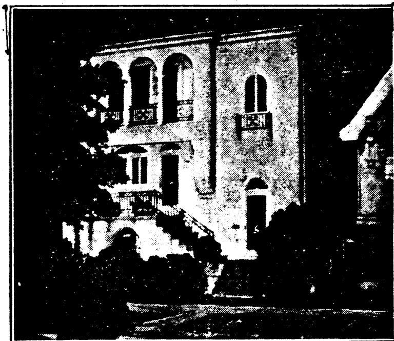
Alvin Karpis, public enemy No. 1, captured by federal agents in New Orleans, lived with a woman seized with him in a lower apartment of this building. They were known as Mr. and Mrs. O'Hara.