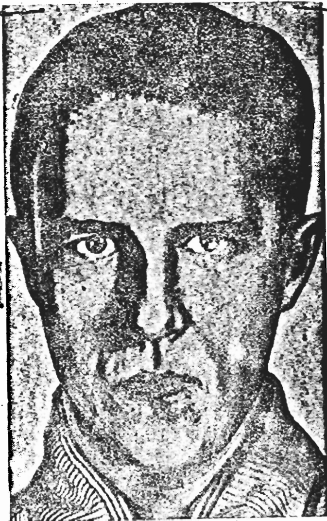
HARBORED HERE —Stockholders of the Biscayne Kennel club charge that officials of the track harbored Alvin Karpis, former Public Enemy No. 1, during the gangster leader's visit in Miami, in a suit demanding appointment of a receiver for the club and a general accounting of how revenues were spent. •The suit promises sensational developments.