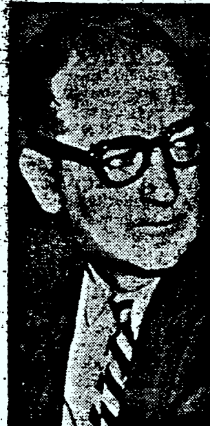
Justice William J. Brennan jr. at hearing yesterday.