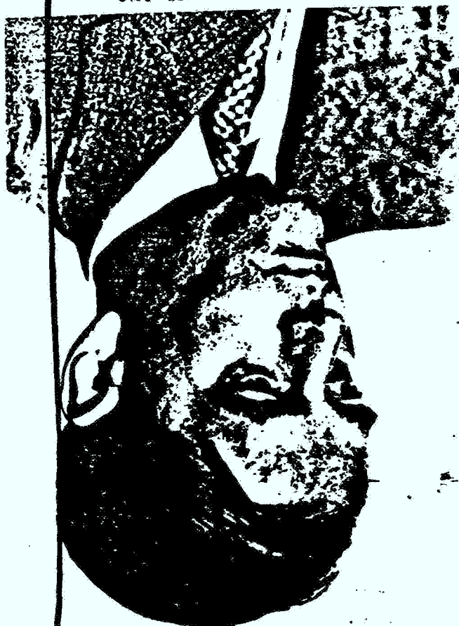
GERMANY APP. 1942 DR. ALBERT SPEER, REICHSMINISTER.

Spent at Robert Dornberger's Center, Fort Osage, Mo.