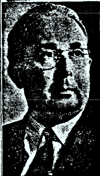
Prof. Leo Szilard