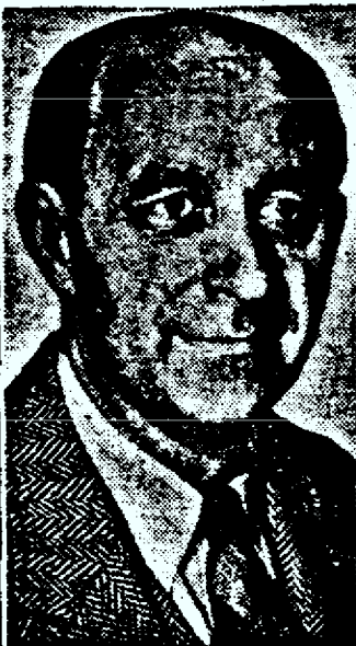
Dr. Enrico Fermi