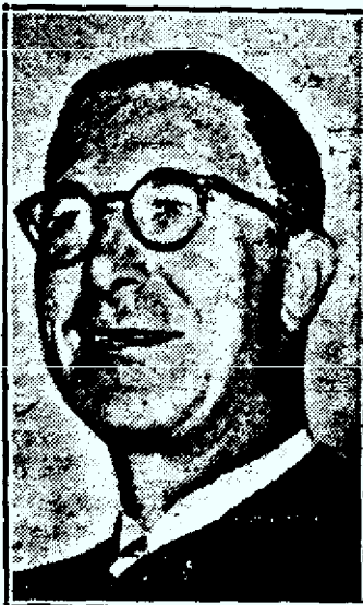
Sen. Estes Kefauver

None of these was acted on by the court today, yet in two or three weeks the justices will be out of town vacationing.