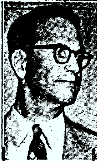
U. S. Attorney Casch Stymied by court's ruling

And there was a slight implication that in some of the recent controversial decisions he was more impressed by the minority views than those of the court majority.