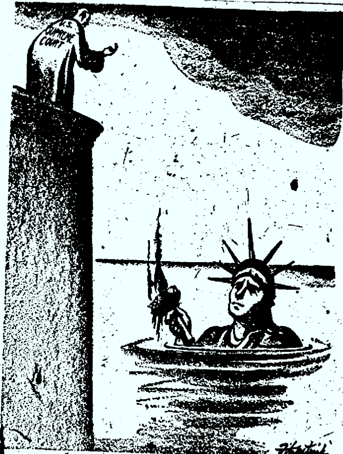
Two cartoon views of the Supreme Court's individual rights decisions. Left, "You May Come Back Now,"