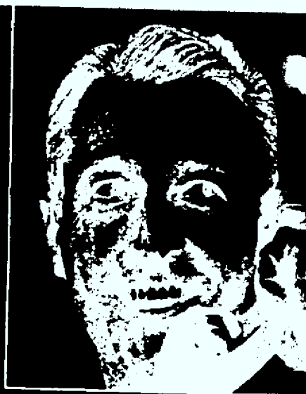
Service: Victory at last