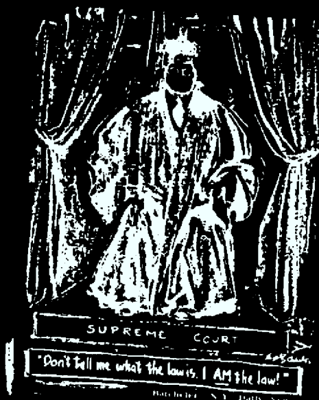
Illustration: N.Y. Daily News