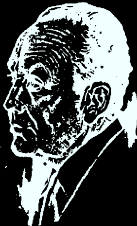
W. R. HEARST JR.

Needless to say, I did not know that the now famous (or notorious) Jencks decision ordering the files of the FBI to be opened to defense lawyers on demand would be followed within a few days by several more rulings just as harmful to the forces of law and order entrusted with our national security, and giving aid and comfort to Communists.