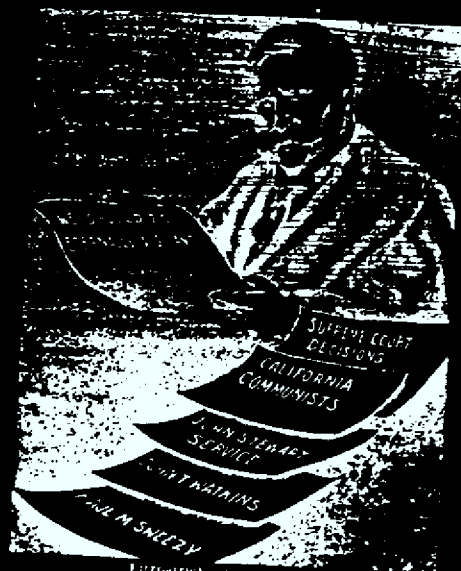
Illustration: St. Louis Post-Dispatch

Two points of view: A faceless, monolithic court or one carrying on a great tradition?