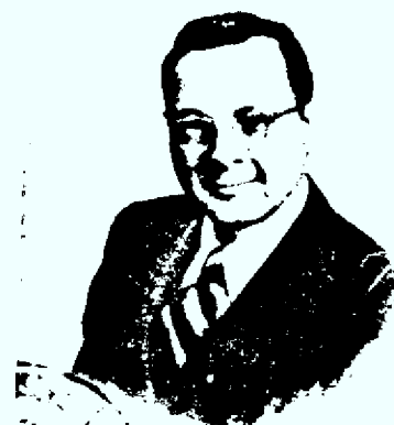
STANLEY DAVID LEVISON March 1947