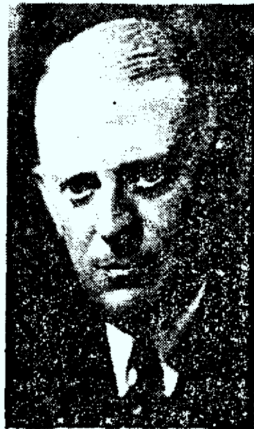
JUDGE PROCTOR Make it brief