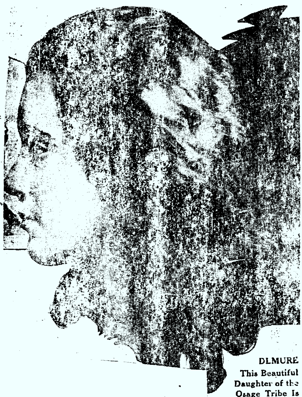
DLMURE This Beautiful Daughter of the Osage Tribe Is Typical of the Indian of High Mentality and Cul- ture. It Is Her Kind the Government Sur- rounds with Fatherly Protection.

0 1 2 3 4 5 6 7 8 9 0 1 2 3 4 5 6 7 8 9 0 1 2 3 4 5 6 7 8 9 0 1 2 3 4 5 6 7 8 9 0 1 2 3 4 5 6 7 8 9 0 1 2