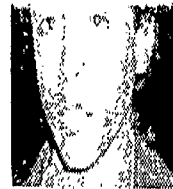
Jordy... 'abused by star'

"It is true he tried to reach an out-of-court