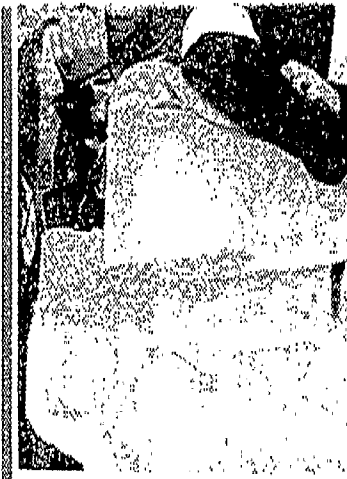
We backo Jacko... fans in London yesterday

Kroll is largely staffed by former CIA officers. One writer said: "If you want someone to dig up the dirt, they are the people." Pepsi denied the probe.