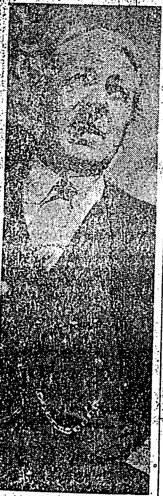
See BELLI, page A-2 Melvin Belli in Albuquerque

Belli represents Thunder Mountain Construction Co. of Santa Fe and its officers who are suing for $2.6 million con-