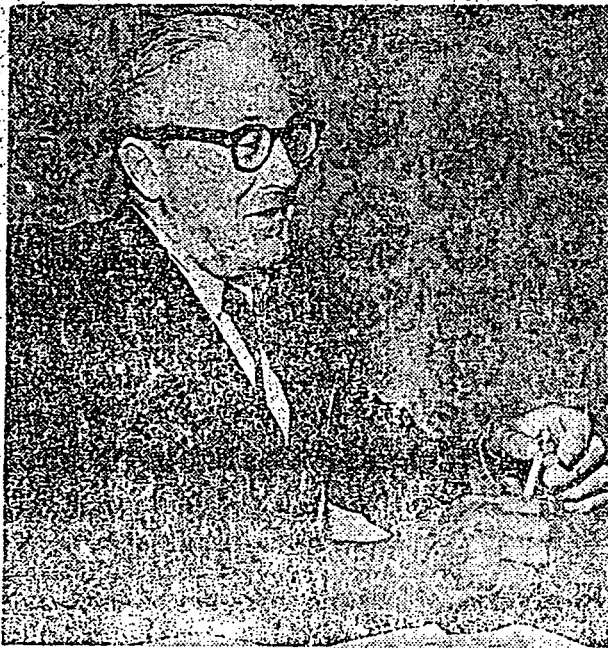
Melvin Belli at Convention ... raps Bobby Kennedy, too

As for a lawyer seeking loopholes to keep a man out of jail, this is a duty which every attorney must assume in searching for what over last ditch technicalities.