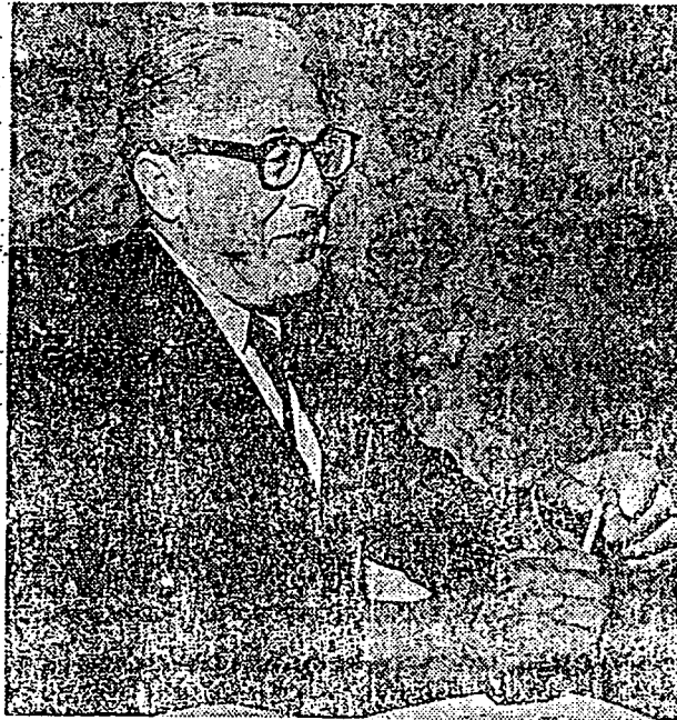
Melvin Belli at Convention

"I subscribe to the necessity of a legal system that can handle better let 99 guilty