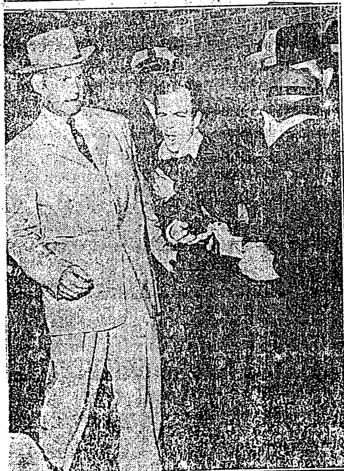
In one of most dramatic photos of all time, Ruby is shown at instant he shot Lee Oswald in basement of Dallas jail.