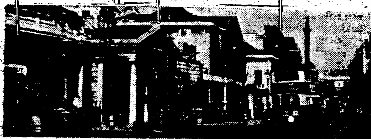
Dover House, Whitehall, photographed after the discovery today.

London: England Charwoman Heard Ticking: MI5 Act: Extra Cabinet Guard