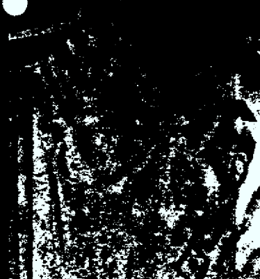
На снимке: Ганс Эдвардсон, капитан экспедиции, в полярной одежде.

1 2 3 4 5 6 7 8 9 10 11 12 13 14 15 16 17 18 19 20 21 22 23 24 25 26 27 28 29 30 31 32 33 34 35 36 37 38 39 40 41 42 43 44 45 46 47 48 49 50 51 52 53 54 55 56 57 58 59 60 61 62 63 64 65 66 67 68 69 70 71 72 73 74 75 76 77 78 79 80 81 82 83 84 85 86 87 88 89 90 91 92 93 94 95 96 97 98 99 100