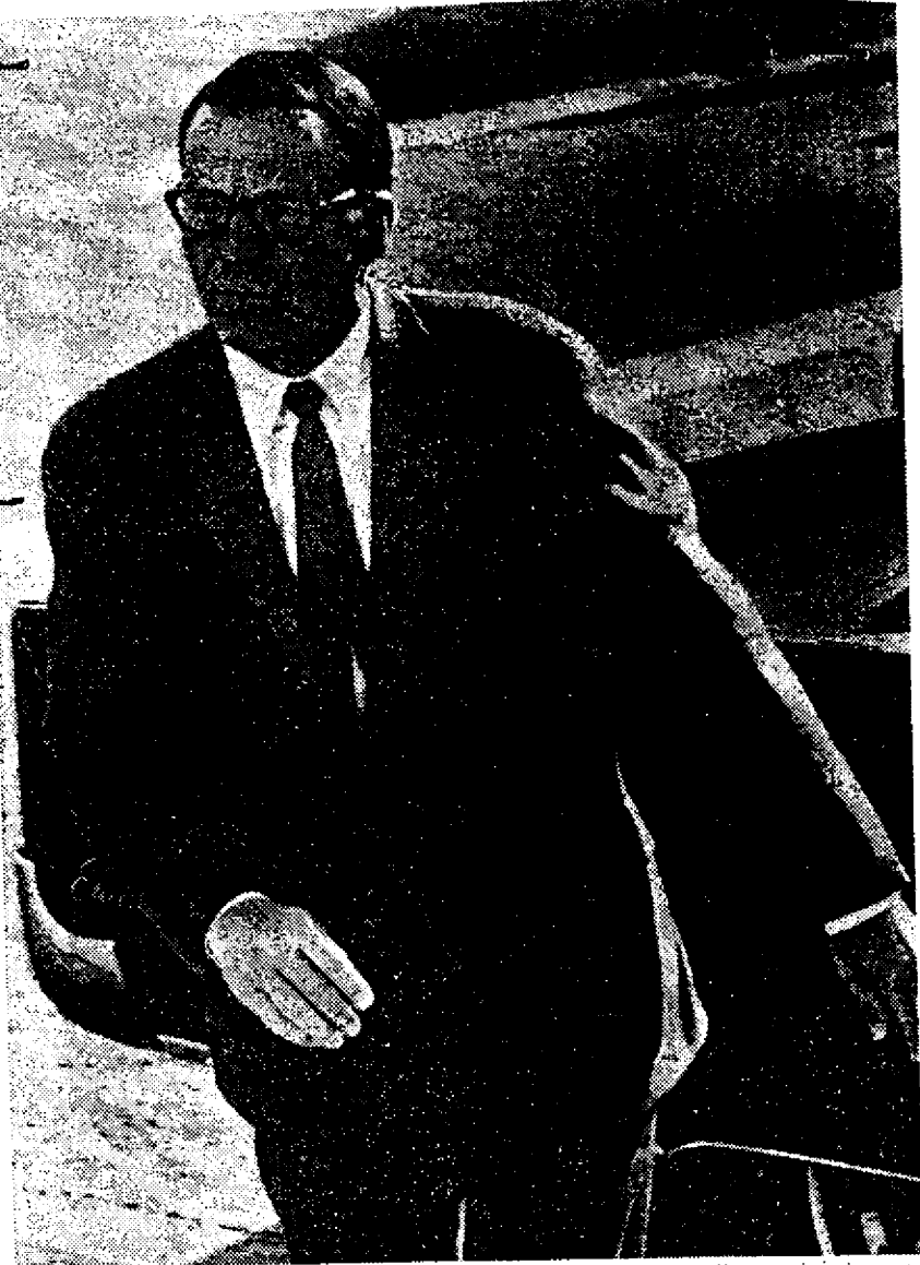
WITNESS —Frank Sinatra enters building in Las Vegas to testify to a federal grand jury investigating alleged "skimming" by casinos.

The grand jury is seeking to learn if casino profits have been siphoned off—possibly to underworld figures with hidden interests—before being reported for tax purposes.