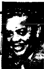
aggression. But, says Du Bois, "there sat at the Dumbarton

Oaks, fears, jealousies, and hopes: fears of renewed German aggression and Asiatic revolt; fears of postwar poverty and despair; jealousies of national rights and imperial power and hopes for eventual peace and progress." Here also is the crux of the colonial question.