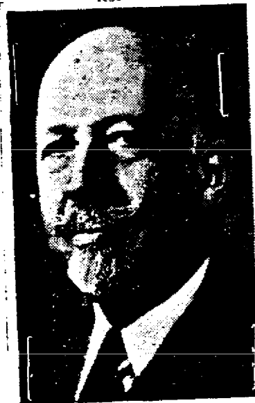
W. E. B. DuBOIS

Independence and democracy for colonial people can be achieved in our time, providing we live up to the Moscow, Cairo, Teheran and Crimean agreements.