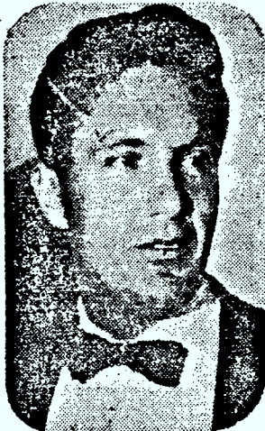
ROBERT STACK Solves Too Much

(And if the lady will send her present address, we will return her treasured evidence forthwith.)