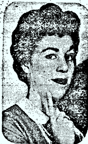
CAROL BURNETT She Made an Impression