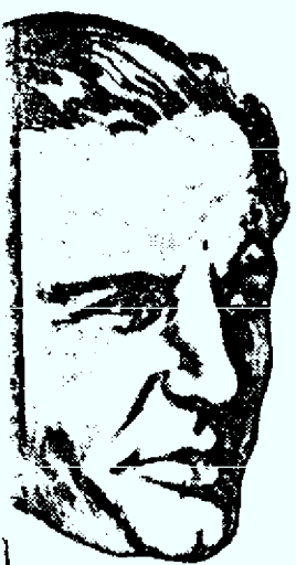
DONALD DUART MACLEAN

By JOHN MATHER, Express News-Analysis Bureau A LEADING American political commentator declared yesterday that Donald Maclean, the missing British diplomat, is "undoubtedly" guiding Russia's new peace overtures.