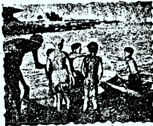
The Maclean children... from last Friday's "Daily Express."