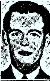
Donald Duart MacLean

Donald Duart MacLean, 38, head of the American Department, and Guy Francis de Morny-Burgess, 40, a specialist in Far Eastern affairs, have been missing from their posts since May 25. Both men have served in Washington. They have been suspended for being absent without leave.