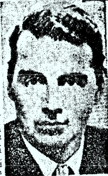
GUY FRANCIS de M. BURGESS

Burgess had returned to England from Washington recently under a cloud. Three times within an hour last February 28, he was caught in an automobile breaking the Virginia State speed limit. Police said he was doing 80 but he claimed diplomatic immunity. Governor John Battle protested to the State Department, which called the incidents to the embassy's attention. Ambassador Sir Oliver Franks asked the British government to recall Burgess promptly, and he was recalled.