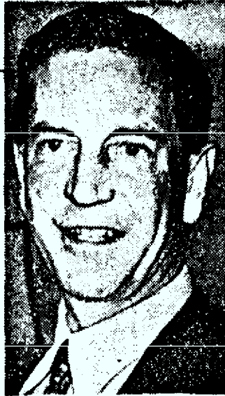
HAROLD PHILBY ... spy case diary

The 51-year-old correspondent disappeared in Beirut, Lebanon, last January, and the