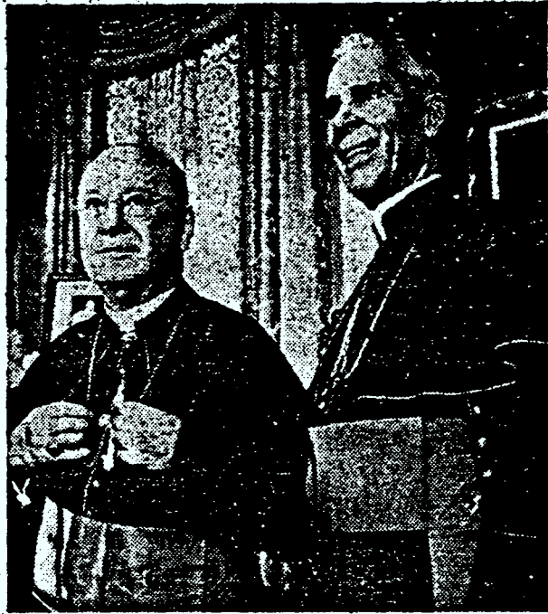
Bishop Sheen with Cardinal Spellman after announcement

Bishop Sheen, one of the church's few bishops without diocesan responsibilities, and Cardinal Spellman, whose spiritual leadership goes far beyond