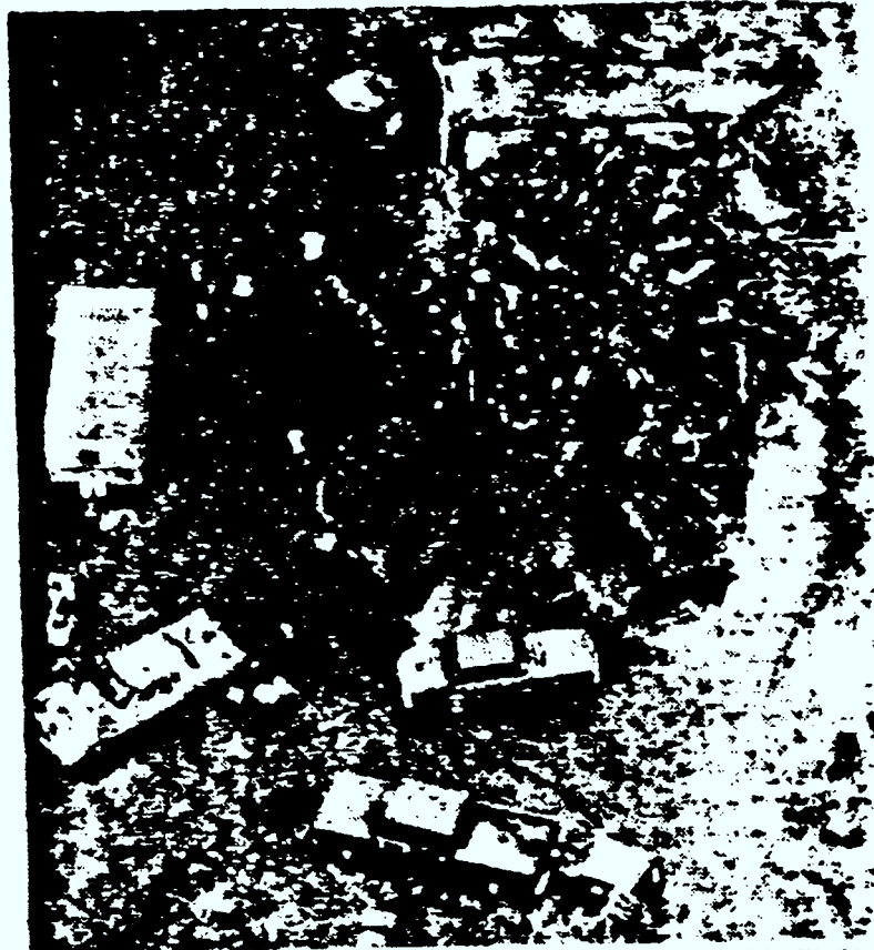
FBI searches rubble of home where white supremacist Robert Mathews died.

[United Press International reported that the Aryan Nations Church of Hayden Lake, Idaho, issued a four-page, typed letter that it claimed to have received Saturday. The group said it contained Mathews' apparent description of his years of conflicts with federal authorities and vowed to "press the