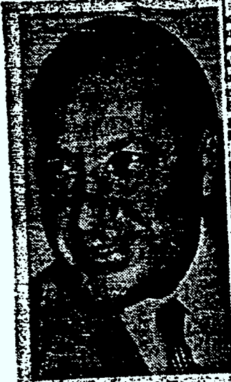
Frank Costello To Quit His Throne?

with the income tax and immigration people. At 44, he generally is pictured in semi-retirement, about ready to hand over the reins to a new No. 1.