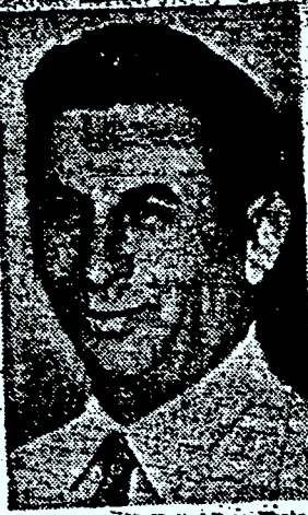
MEYER LANSKY.