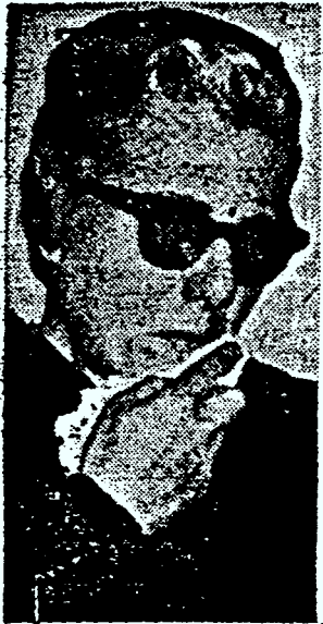
A WIDOW WEEPS — Albert Anastasia, widow of the slain gangster, after the funeral yesterday.