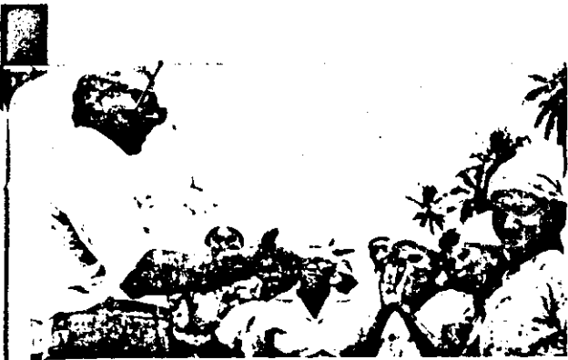
Premier Cheddi Jagan talks with wives of cane cutters on a sugar plantation on the west bank of the Demerara River.

Fowler Hamilton, chief of the U. S. foreign-aid program, who met with Jagan in Washington, says, "The fact that a government is building a Socialist economy does not exclude it from aid. The standard is independence, not acquiescence to our view."