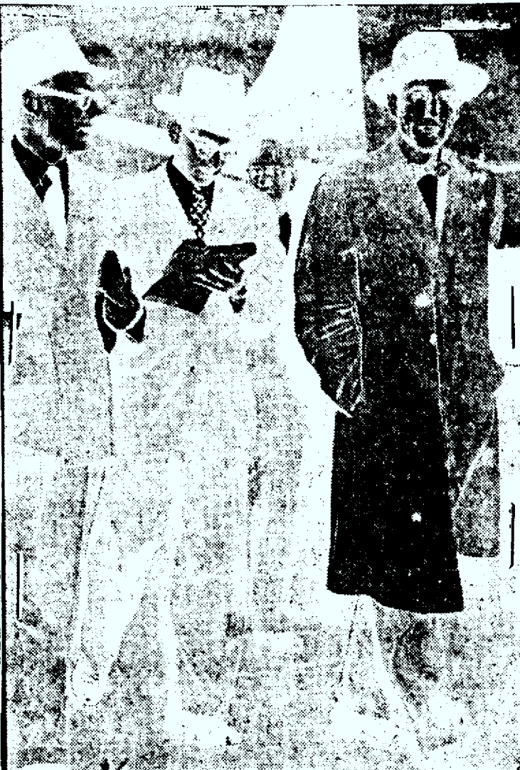
John E. Service talks with newsmen as he leaves the plane which brought him to Washington from Seattle. He will appear before the Senate subcommittee later to answer charges made by Senator McCarthy, Republican, of Wisconsin.

"Will you also inform Mr. Hoover," he wrote, "that I shall greatly appreciate it if he will have one of his agents available when I address the Senate . . . so that I may turn over to him documents in the Lattimore case which I consider of some importance."