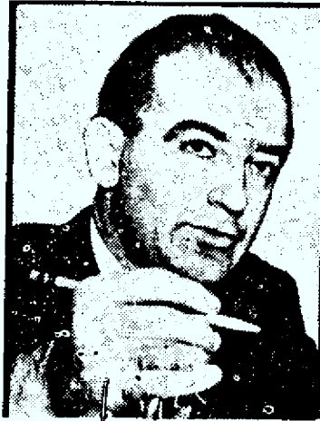
SEN. JOE MCCARTHY