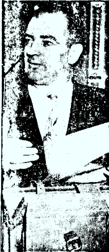
SEN. McCARTHY 81 anonymous cases

Senate Democratic Leader Scott W. Lucas promised today to obtain an early airing of Sen. Joseph R. McCarthy's charges of Communist infiltration into the State Department.