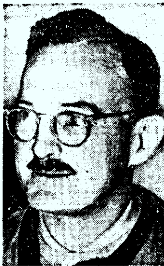
OWEN LATTIMORE