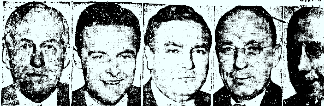
SENATOR TYDINGS. SENATOR LODGE. SENATOR MCMAHON. SENATOR HICKENLOOPER. SENATOR INVESTIGATING SUBCOMMITTEE—This Senate Foreign Relations subcommittee headed by Senator Tydings, Maryland, will investigate charges that Communists are employed in the State Department.