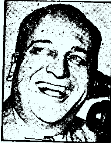
SEN. SCOTT LUCAS