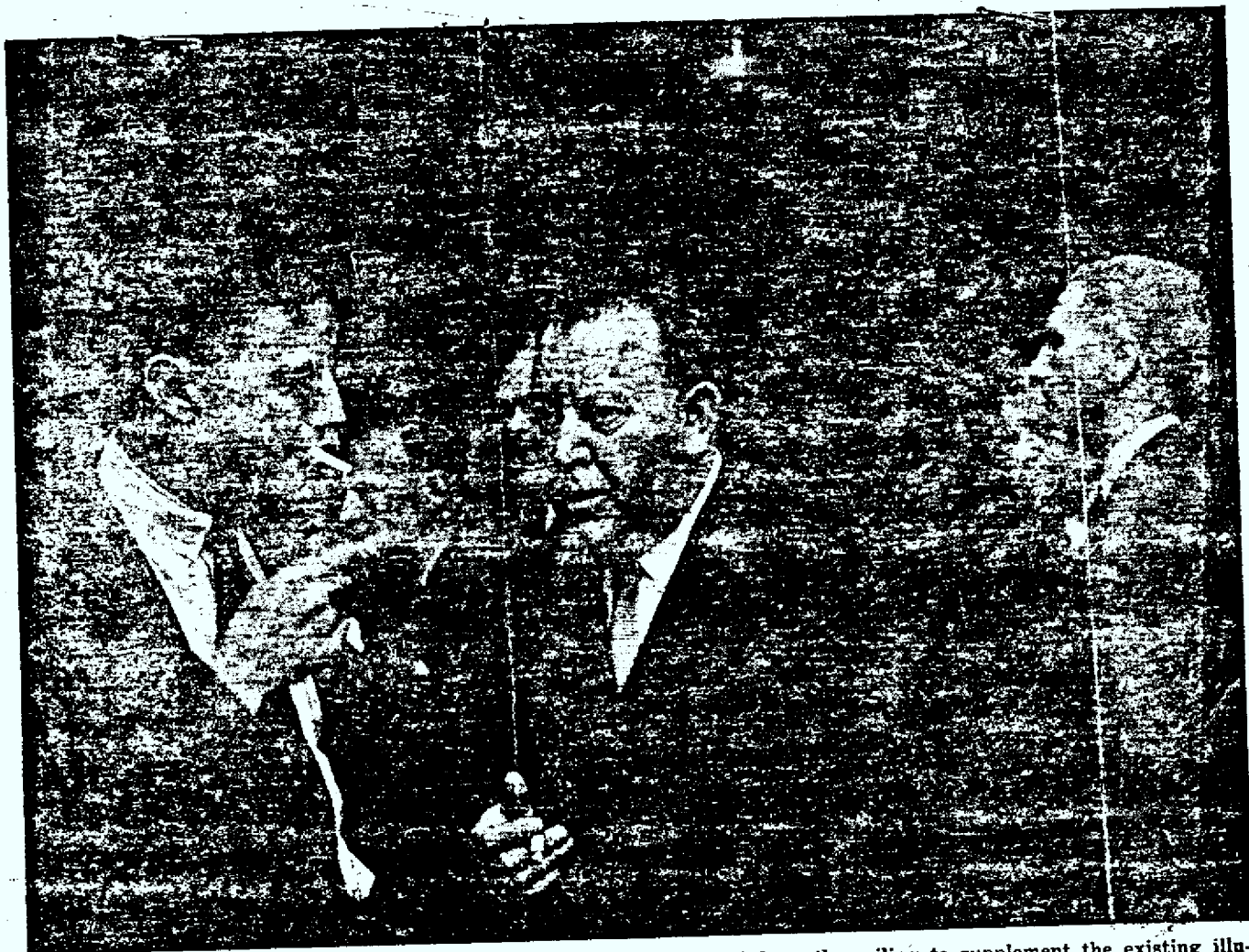
TRYGVE LIE, UN Secretary-General, is shown talking to reporters in an important session. One No. 6 flashbulb was

reflected from the ceiling to supplement the existing illumination. 1/100, at f/3.5.