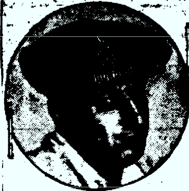
RALPH CAPONE. Sentence: Six Months More of Life.